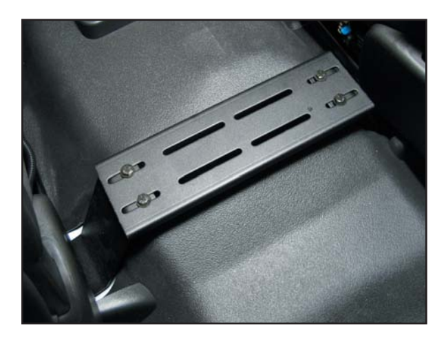
Loosely pre assemble rear hump bracket with 1/4" x 3/4" bolts and flat washers, then position it under the OEM rear seat brackets.